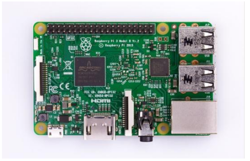
Fig 1-Raspberry Pi 3